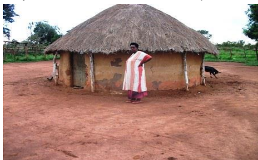
One of the ladies at her old house before the loan

Mbiriize Women Empowerment Group is found in Nakasongola District. The group formed a Community Based Organisation in 2012. With a microcredit capital loan and a training-grant from well-wishers in the Netherlands they would be able to do self-empowerment and employment for the women in the community. Yes, the