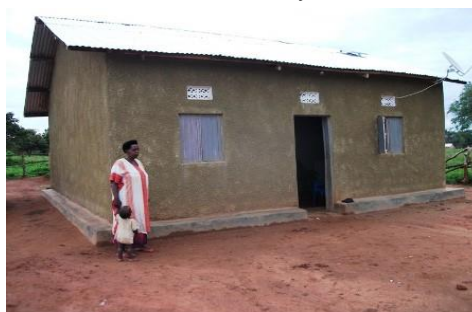
The same lady and her new house built from the loan

dream became true and they empowered themselves with different projects and businesses. The whole community looks very vibrant with booming businesses around the village.